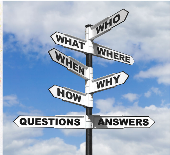
Text in picture: Are there any question?