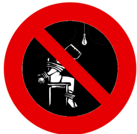
Prohibition on torture