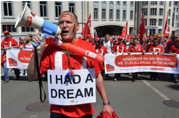
Protest of a union in Belgium