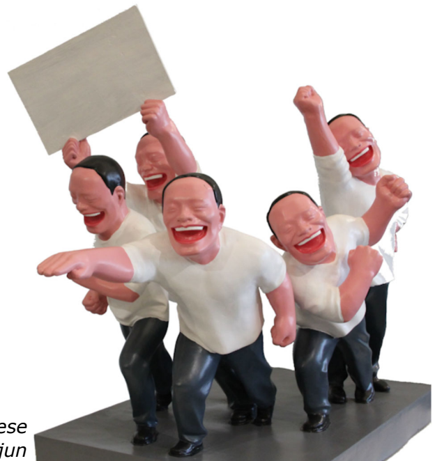
A piece of art of Chinese artist Yue Minjun