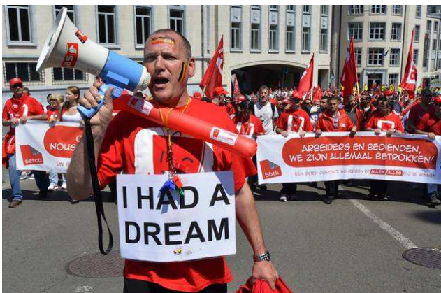
Protest of a union in Belgium