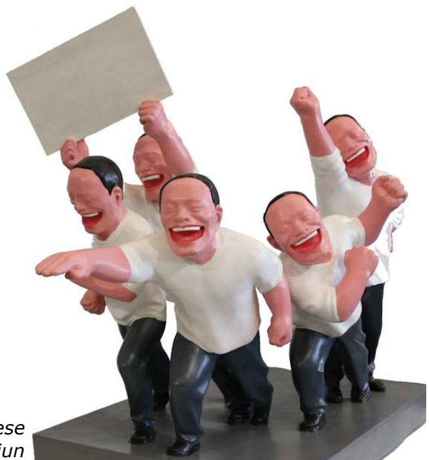
A piece of art of Chinese artist Yue Minjun