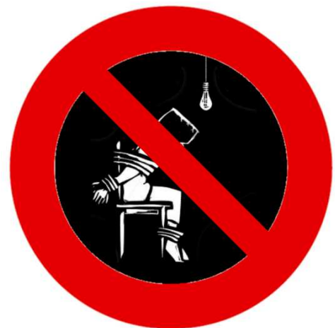
Prohibition on torture